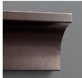
-22 Oiled Bronze