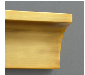
-40 Aged Brass