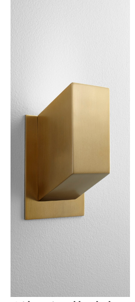
With optional backplate