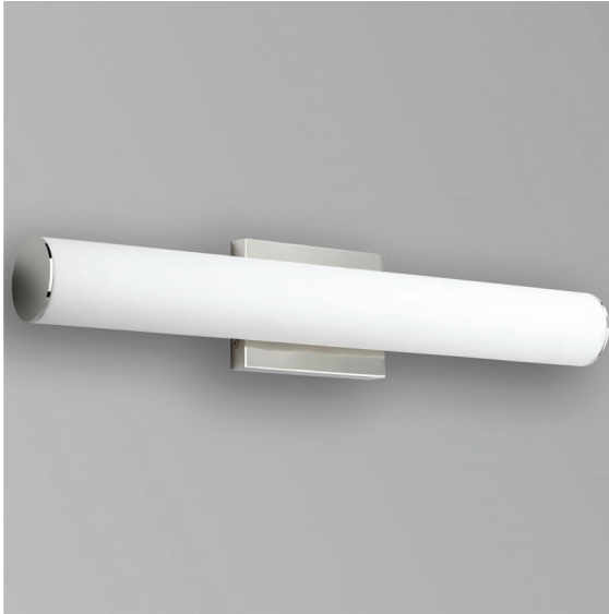
-20 Polished Nickel