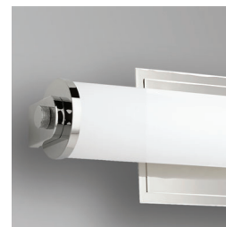
-20 Polished Nickel