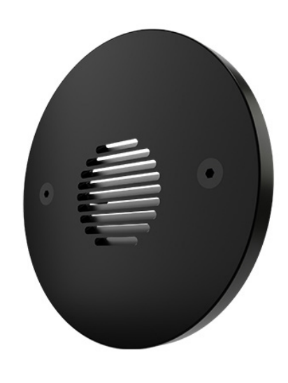
*Requires magnetic low voltage dimmer.