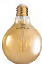
MLE322 3W LED G25 Filament Lamp E26 Base; 3-3/4" Dia. x 5-5/16" H (LG6803DGD-E26)