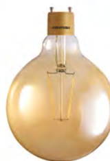
MLG222 3W LED G40 Filament Lamp GU24 Base; 4-7/8" Dia. x 7" H (LG6903DGD-GU24)