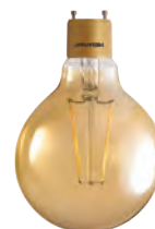
MLG322 3W LED G25 Filament Lamp GU24 Base; 3-3/4" Dia. x 5-9/16" H (LG6803DGD-GU24)