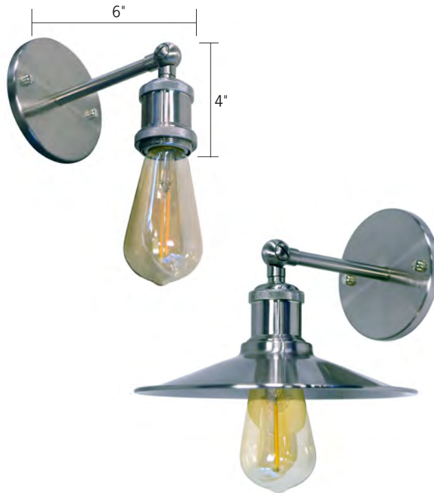
Shown with optional CTMC200-NK shade

Canopy mount suitable for dry or damp location.