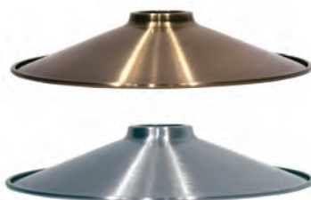
CTMC200-(NK, ABR) Cone Shade, Small (7-7/8" Dia.)