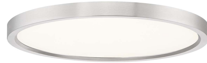
Brushed nickel (BN)