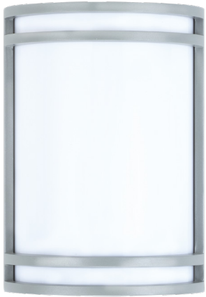
Brushed Aluminum (BA)