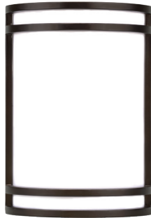
Oil Rubbed Bronze (OB)