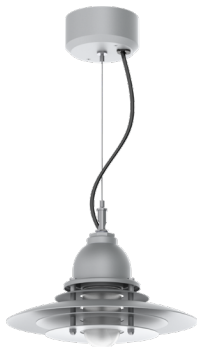
CN1308GV SHOWN WITH RDC5CD