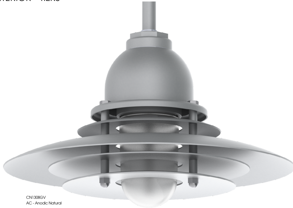
CN1308GV AC - Anodic Natural