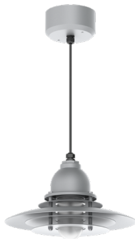
CN1308GV SHOWN WITH RDC5CM