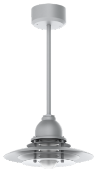
CN1308GV SHOWN WITH RDC5PM