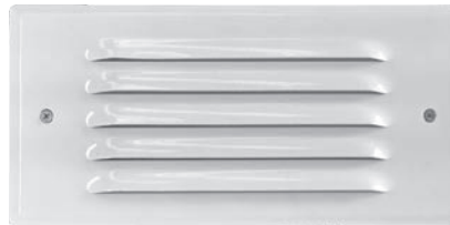
Louvered door option