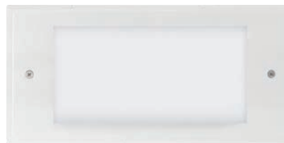
Opal lens option