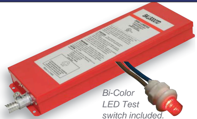
Bi-Color LED Test switch included.