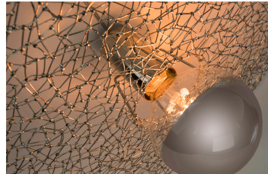
For Auroral, a G40 half-mirror LED bulb is supplied, which directs the light upward making the fixture glow.