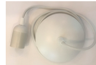
10' of electrical cord, canopy and installation hardware is supplied standard with the product.

Ango fixtures are made with natural materials that have variation in texture and color. The images shown on this page show indicative texture and color. Please contact info@wakanine.com to request materials samples/swatches.