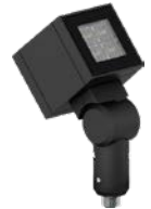
Lador 2 TKM