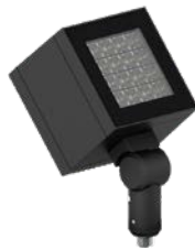
Lador 4 TKM