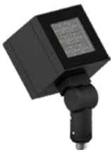
Lador 3 TKM