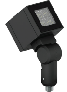
Lador 2 TKM