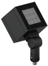
Lador 3 TKM