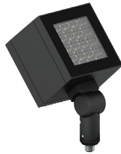
Lador 4 TKM