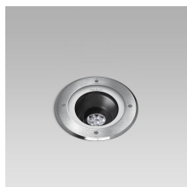
round trim above the ground