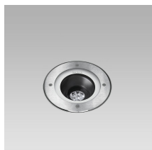
round trim flush with ground