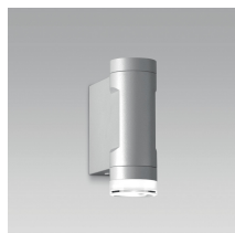
twoway - opal + blade