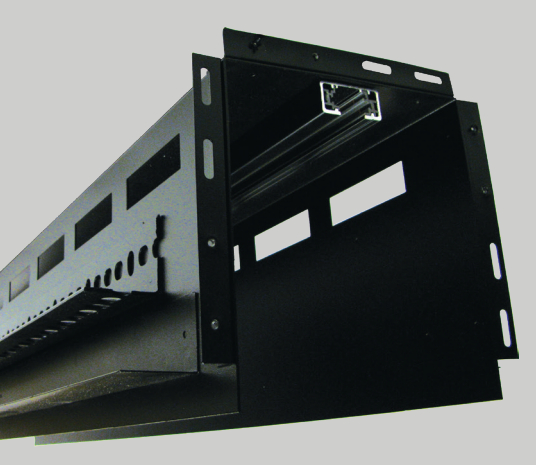
Manufactured in the USA - IBEW