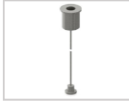
Cable Suspension Kit