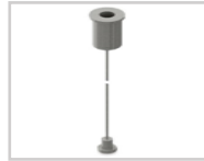
Cable Suspension Kit