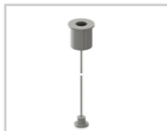
Cable Suspension Kit